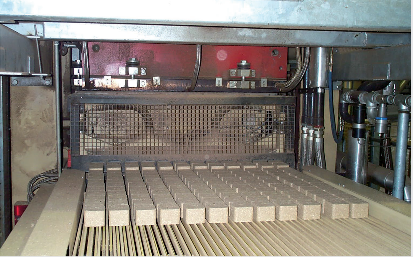
AUTOMATIC PACKAGING SYSTEM