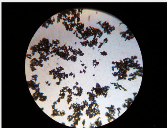
RESIN BEFORE PULVERIZATION AND FILTERING